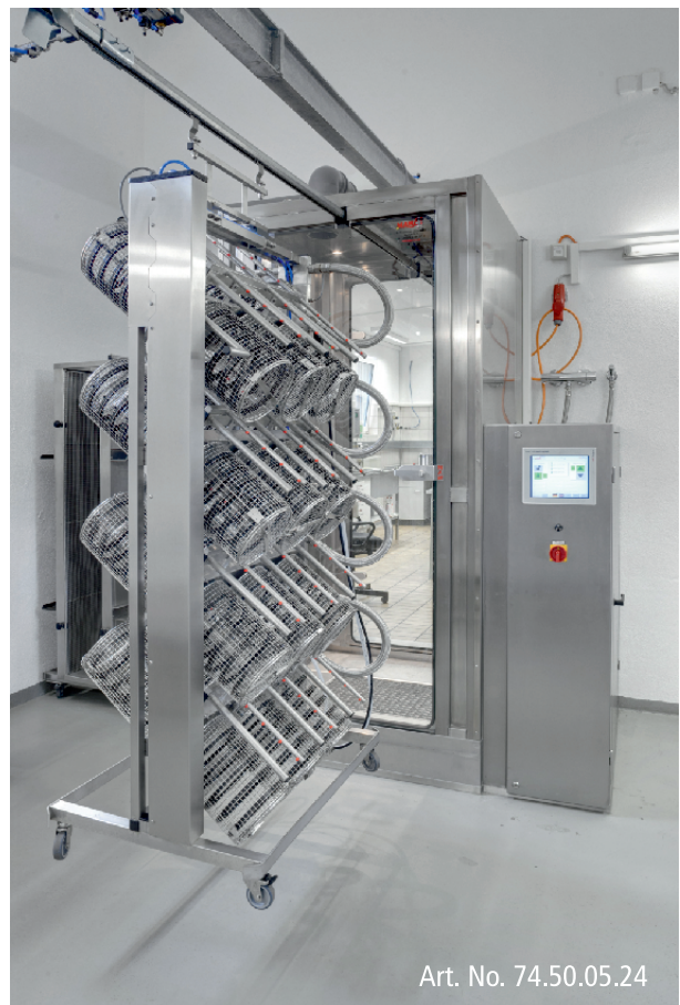
Art. No. 74.50.05.24